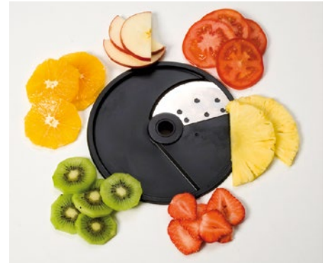
Tomato slicer (TO)

G3 3 mm G6 6 mm G10 10 mm G4 4 mm G8 8 mm G12 12 mm