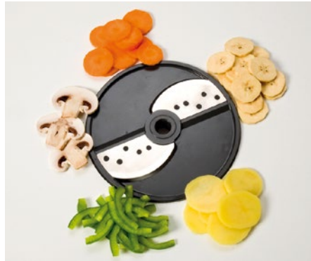
Coarse cut (G)

G3 3 mm G6 6 mm G10 10 mm G4 4 mm G8 8 mm G12 12 mm