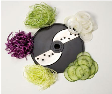
Fine cut (F)