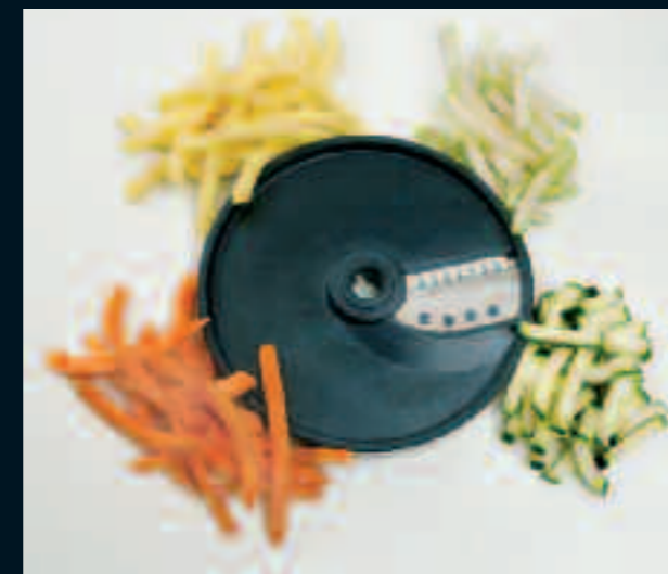
French fries (BT)