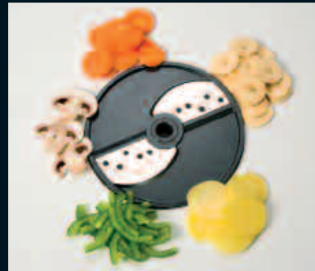
Coarse cut (G)