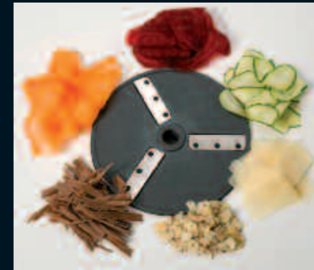
Shaving cut (HS)