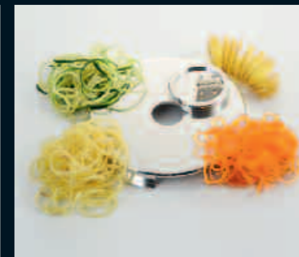
Vegetable spaghetti cutter (SP)