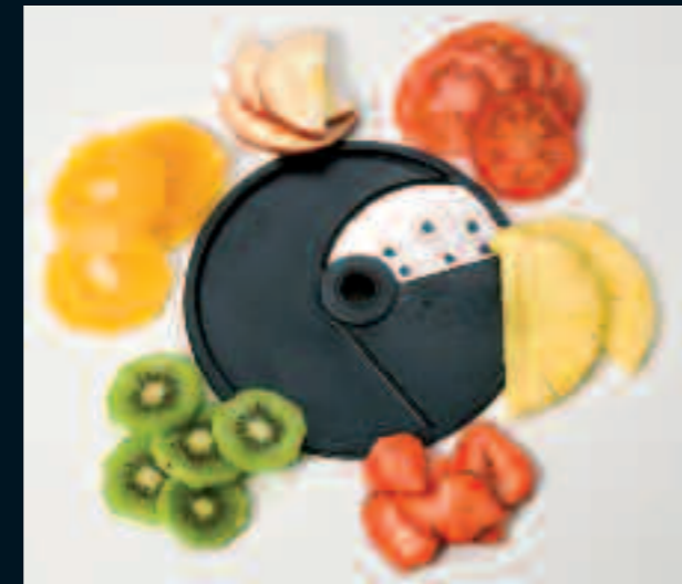
Tomato slicer (TO)