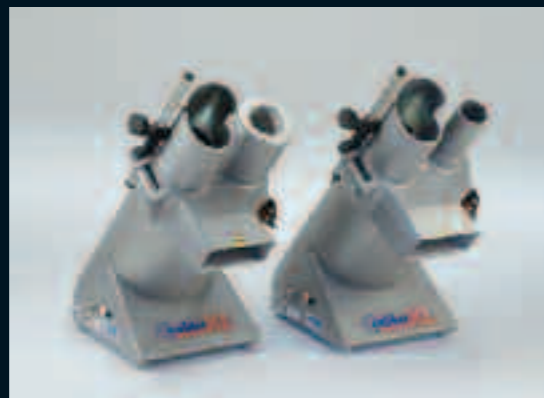
anliker XL: The anliker5's big sister for large kitchens, canteens and municipal caterers. With new, ceramically reinforced, scratch-resistant and non-stick surface coating.