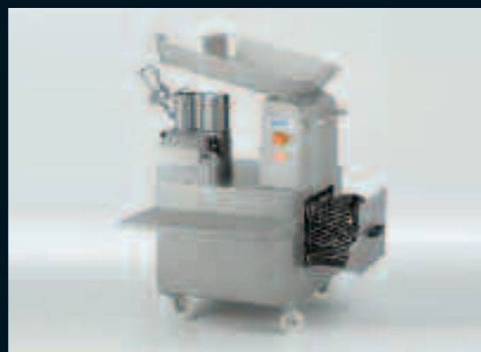
anliker Multicut 240: Processes up to 500 kg per hour. Ideal for caterers, food manufacturers and other large-scale processors. With new, ceramically reinforced, scratch-resistant and non-stick surface coating.