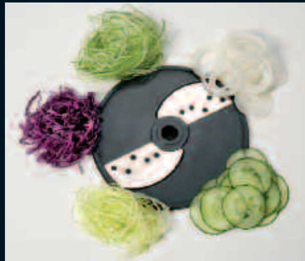
Fine cut (F)