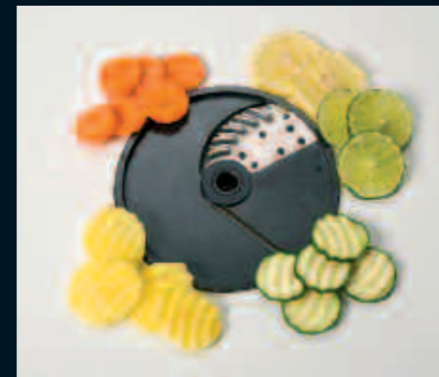
Wave cut (SU)