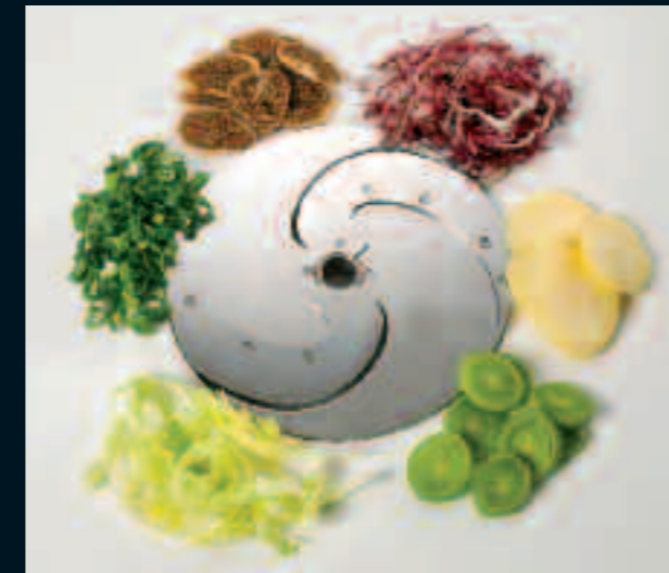
Sickle blade (SM)