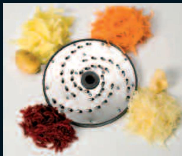
Shredding disc (RS)